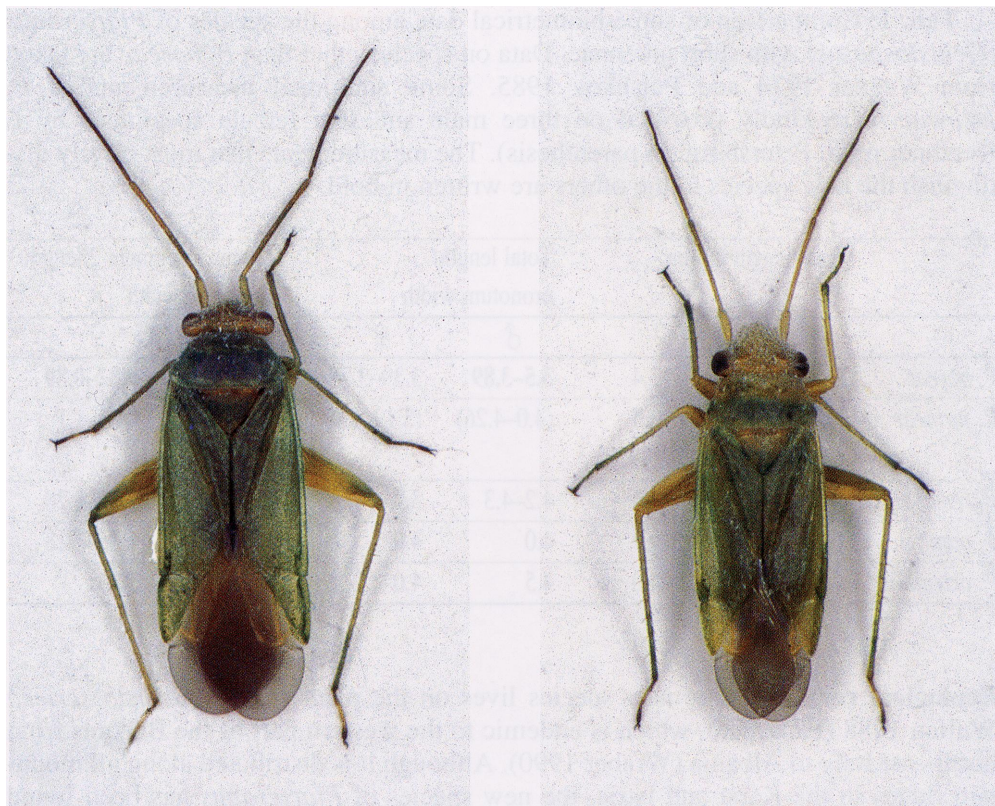
Fig. 1: Platycranus boreae sp. n., left male (holotype), right female (paratype).