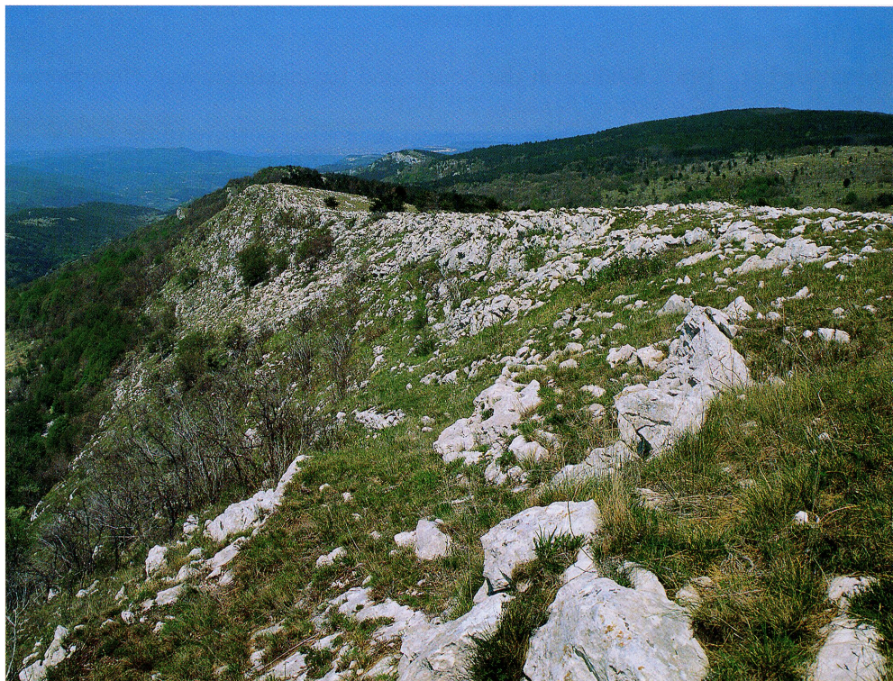
Fig. 6: The habitat of P. boreae sp. n., exposed calcareous ridge of Mt. Lipnik.

Derivatio nominis: The new species is named after bora, the strong and cold northern wind (burja in Slovene, borea in Latin), a strong elemental force in the habitat of P. boreae , situated on the exposed mountain ridge.