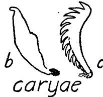
FIG. 146. Phytocoris caryae Knight,—male genital claspers, (b) right clasper, lateral aspect, (c) flagellum. Greatly enlarged. Drawing by Dr. H. H. Knight.

Scutellum greenish yellow, an oblique orange mark each side of median line at middle. Sternum and pleura pale yellowish.