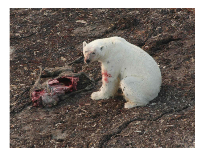
Figure 3. A polar bear looks up from the recently killed caribou it was eating at Keyask Island (58.16958°N 92.85194°W) on July 26, 2010.

(Hanson et al. 1972; Kerbes et al. 2006; Alisauskas et al. 2011), with highest increase and geographic expansion being on the Cape Churchill Peninsula (Rockwell et al. 2009).