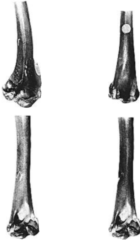
Figure 3. Milnea gracilis , type, BM(NH) 47457. Lower, stereophotographs of palmar view. Upper right, anconal view, distal end. Upper, anconal view, proximal end. All about \times 1.2 .

than to the Burhinidae. The following differences that Milnea exhibits from Burhinus will serve to demonstrate the significant morphological gap between these two taxa: (1) the humerus is decidedly heavier and more robust, (2) the external condyle is relatively smaller, (3) the olecranal fossa is less deep, (4) the area distal to the impression of M. brachialis anticus is less depressed and excavated, (5) the entepicondyle is less pronounced, (6) the pneumatic fossa is much smaller, (7) the capital groove and area distal to the head (on anconal surface) is much less excavated, (8) the external tuberosity is less pronounced, (9) the ridge extending distally down the shaft from the median crest is less pronounced, and (10) the bicipital surface is less inflated, less bulbous, and flatter.