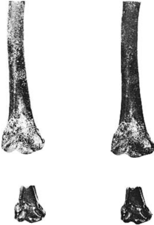
Figure 2. Telmatornis affinis (lower), type, YPM 845, and Telmatornis rex (upper), type, YPM 902. Stereophotographs of palmar view. Both about \times 1.5 .

tendons and ligaments are in similar positions, (2) the attachment of M. pronator brevis is formed into a deep pit and is located palmarly, (3) in ventral view, the tendon pits on the entepicondyle have similar shapes and relative positions, (4) the entepicondyles do not project much distally or anconally, (5) the olecranal fossa is shallow, similar in shape, and grades rather smoothly into the shaft, and (6) the internal condyle is not bulbous but rather elongated lateromedially and projects distally only moderately relative to the external condyle.