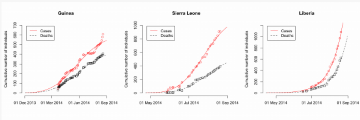
Fig. 1: Dynamics of 2014 EBOV outbreaks in Guinea, Sierra Leone and Liberia.

Data of the cumulative numbers of infected cases and deaths are shown as red circles and black squares, respectively. The lines represent the best-fit model to the data. Note that the scale of the axes differ between countries.