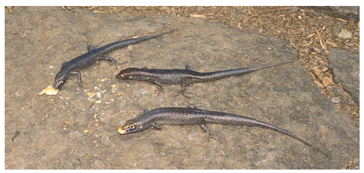
Figure 2 . Euprepis atlanticus foraging on cookie crumbles provided by tourists at one of the island's most visited sites.

One of two different historical processes may have occurred on Fernando de Noronha Archipelago: (1) lizard densities were lower there than in present days and went through an increase following human colonisation due to introduction of new food resources, or (2) lizard densities were high even before human colonisation. Considering the evolutionary trend of organisms living in isolated habitats free of predators, it seems to us that the second assumption is more realistic (see Pianka, 1973; Bennett & Gorman 1979; Schoener & Toft 1983; Vitt & Pianka 2005). Several lizard