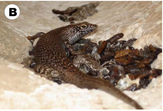
Figure 1 . The Noronha skink Euprepis atlanticus mouthing a dry seed of the leguminous shrub Acacia sp. (A), and sitting on a pile of faeces of the Rock cavy Kerodon rupestris (B).