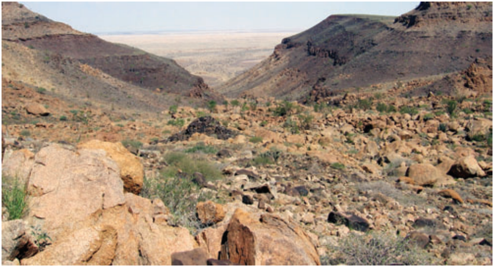
Fig. 5. Brandberg Massif (Namibia), lower slopes of Massif in Goaseb (Ga-Asab) Gorge, facing southwest, wet year. Dominant vegetation, Acacia montis-usti Merxm. & A. Schreib., Commiphora sp., Euphorbia sp. and Moringa ovalifolia Dinter & A. Berger. Rocky flats and slopes, habitat of Hottentotta conspersus (Thorell, 1876), Hadogenes tityrus (Simon, 1888) and Opisthophthalmus ugabensis Hewitt, 1934.