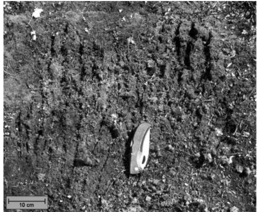
FIGURE 1. Claw marks assumed to be made by a Grizzly Bear were observed in the tundra along the north coast of Wapusk National Park on 29 May 2006. The penknife is 12 cm.

While there have been occasional reports of Grizzly Bears or their sign since the onset of research in this area (e.g. Figure 1), we have limited the observations for this paper to confirmed sightings, as suggested by Clark (2000). Confirmed sightings require that either