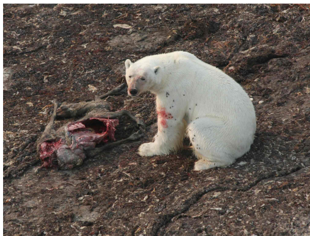
Figure 3. A polar bear looks up from the recently killed caribou it was eating at Keyask Island (58.16958°N 92.85194°W) on July 26, 2010.

(Hanson et al. 1972; Kerbes et al. 2006; Alisauskas et al. 2011), with highest increase and geographic expansion being on the Cape Churchill Peninsula (Rockwell et al. 2009).